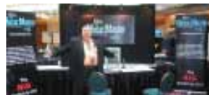
Exhibit Booth ...$1700 per booth (includes 1 full tuition).